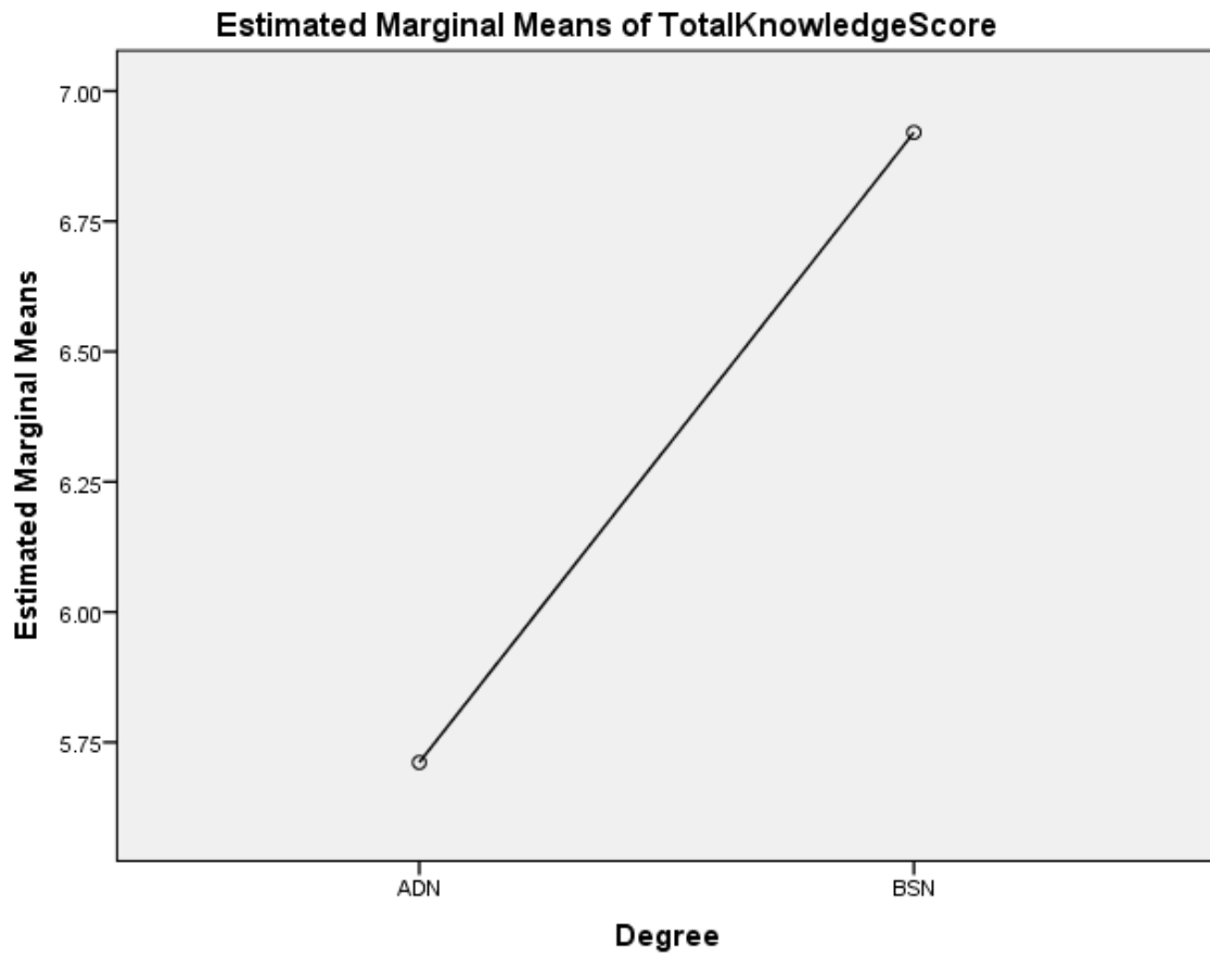
Figure 4.1 Total Knowledge Score by Nursing Degree